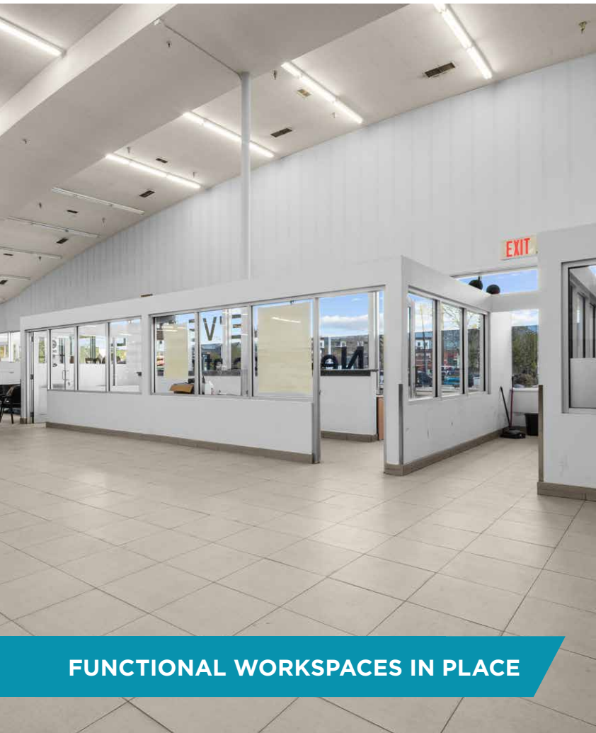
FUNCTIONAL WORKSPACES IN PLACE