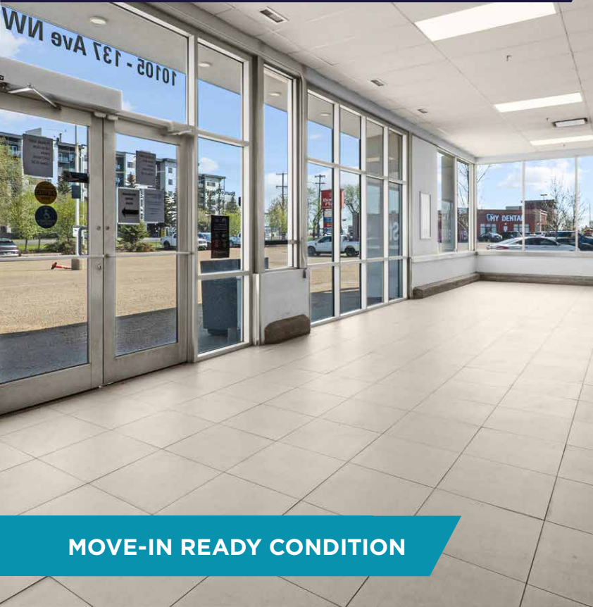
MOVE-IN READY CONDITION