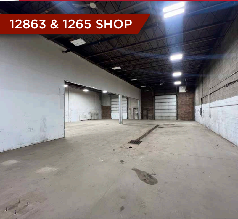
12863 & 1265 SHOP