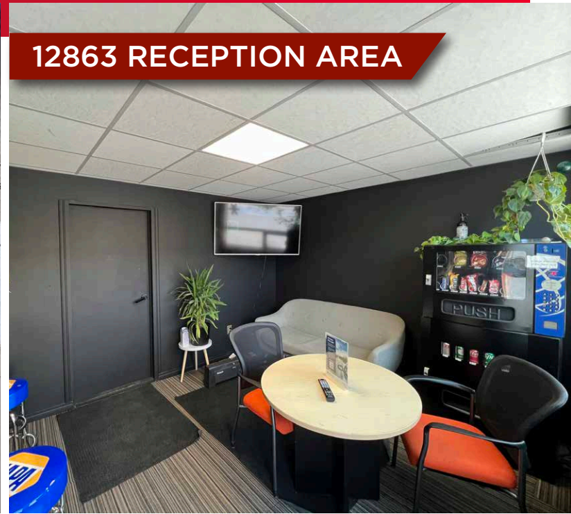
12863 RECEPTION AREA