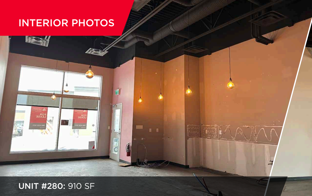
UNIT #280: 910 SF