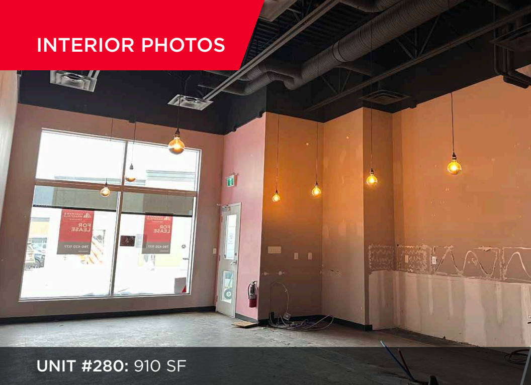
UNIT #280: 910 SF