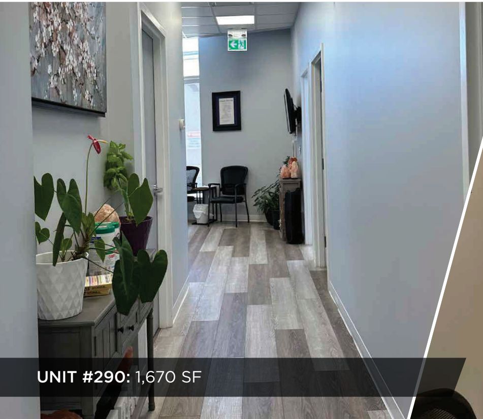
UNIT #290: 1,670 SF