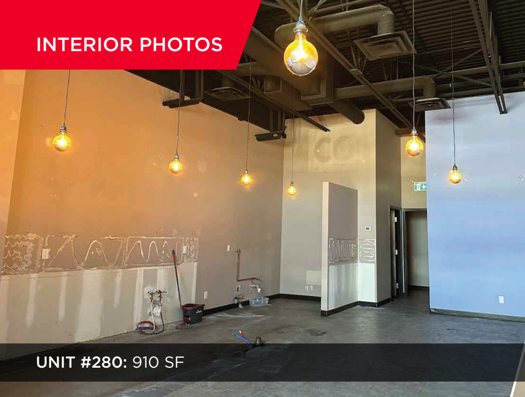
UNIT #280: 910 SF