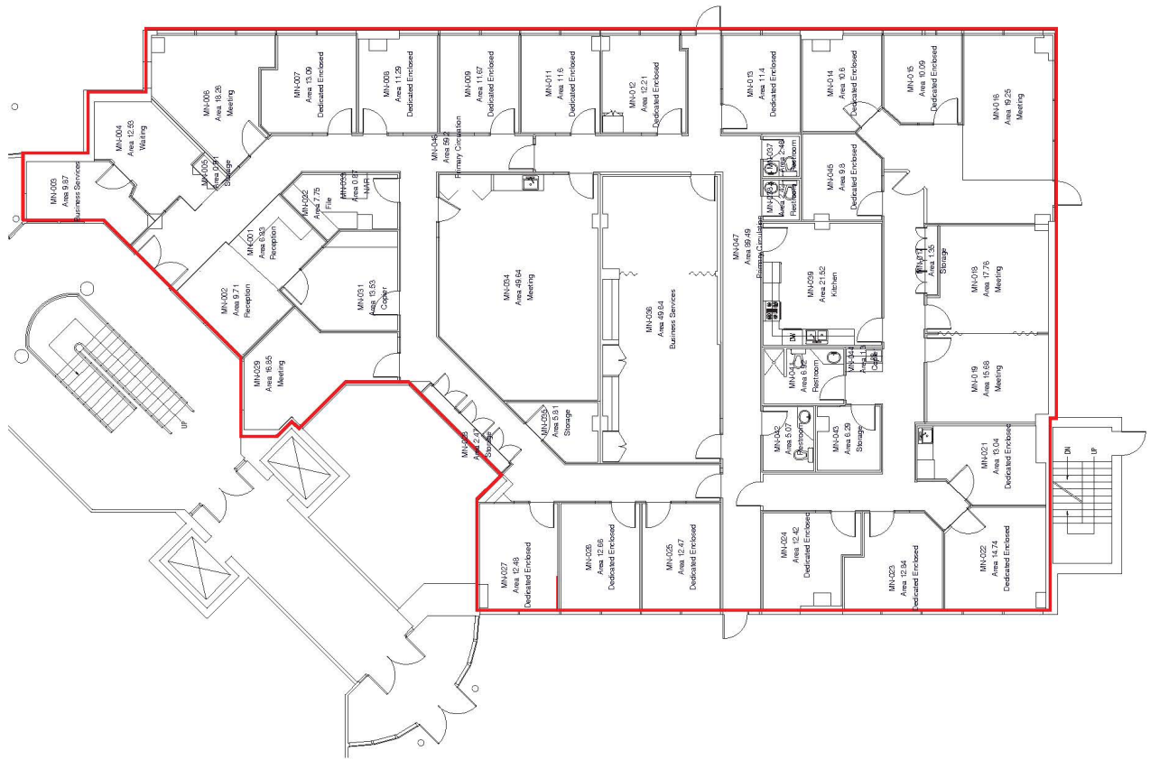
SCHEDULE "A" OUTLINE SKETCH OF PREMISES