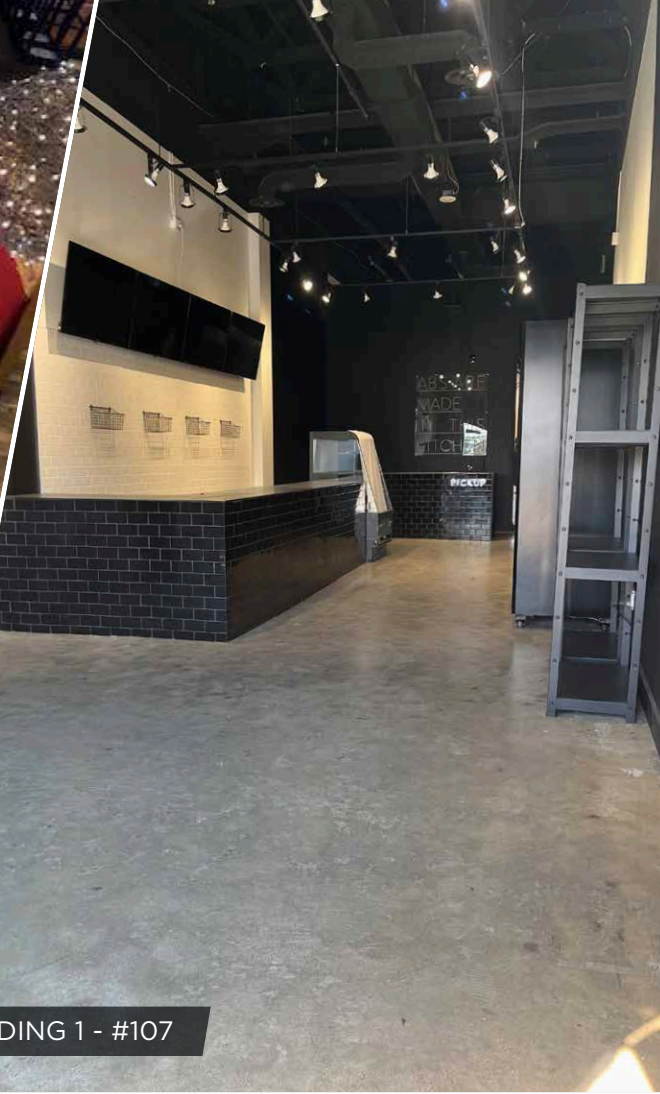
BUILDING 1 - #107