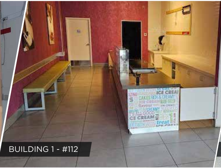
BUILDING 1 - #112