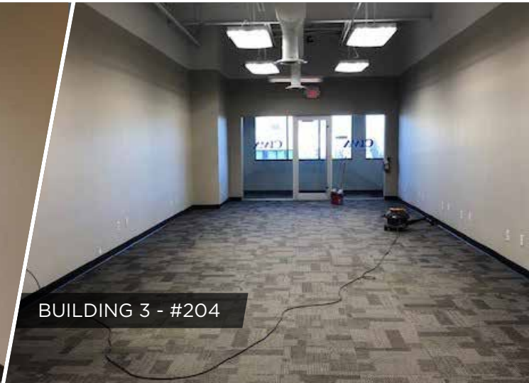
BUILDING 3 - #204