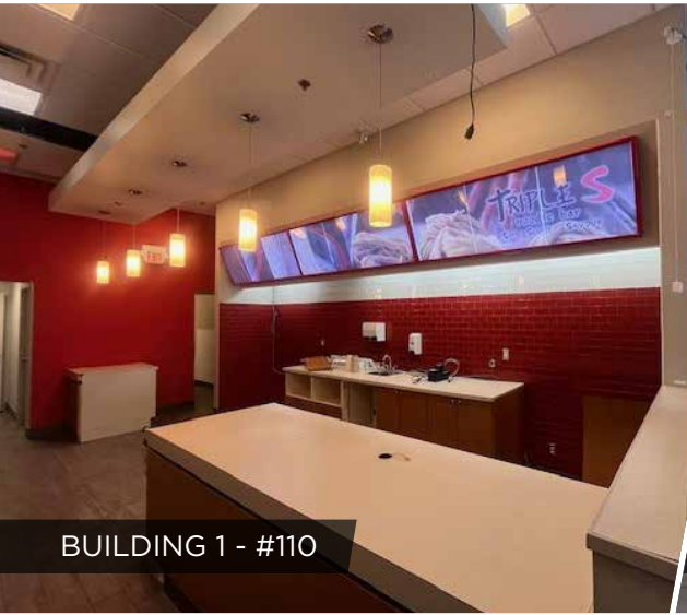
BUILDING 1 - #110