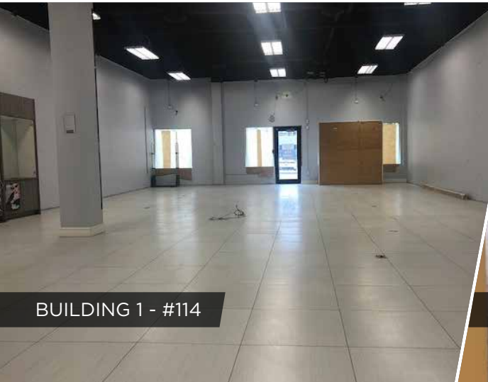
BUILDING 1 - #114