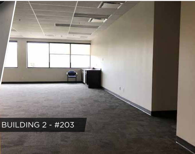
BUILDING 2 - #203