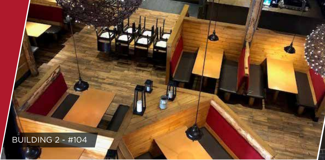
BUILDING 2 - #104