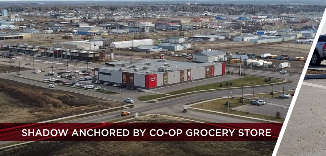
SHADOW ANCHORED BY CO-OP GROCERY STORE