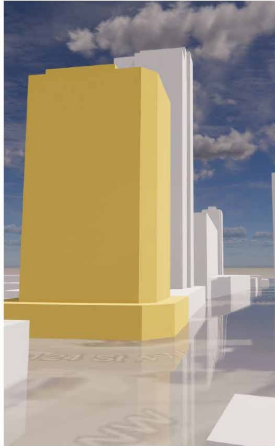
View East along Jasper Avenue