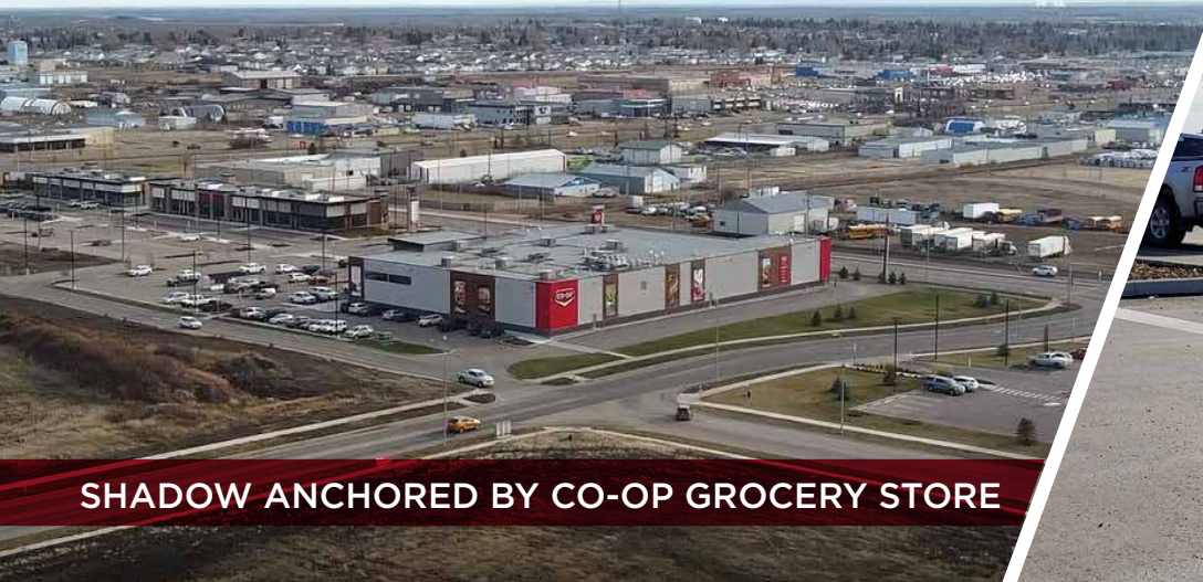
SHADOW ANCHORED BY CO-OP GROCERY STORE