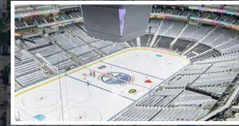
4 MINUTES FROM ROGERS PLACE