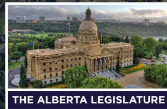
THE ALBERTA LEGISLATURE