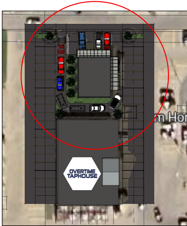
NEW BUILDING WITH DRIVE-THRU